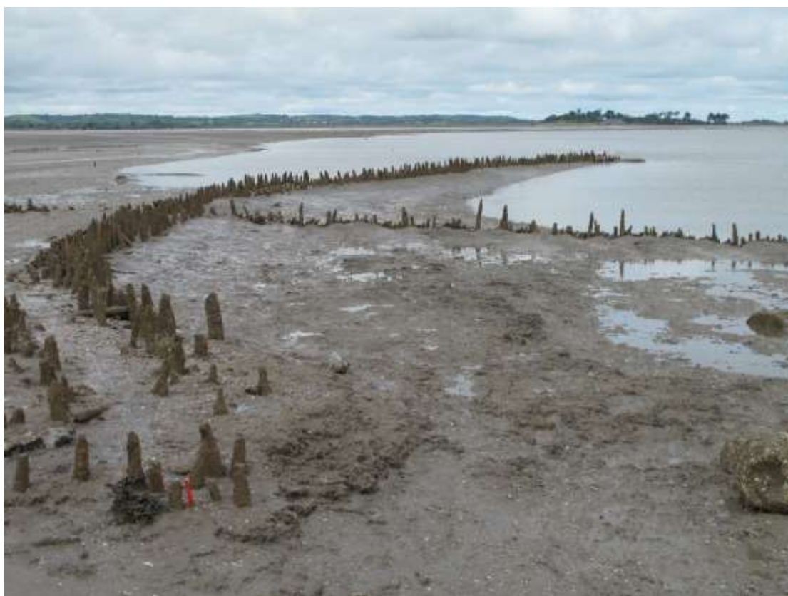
Boland's Rock Fish-traps – located about five miles down-river from Clarecastle.

As long as the River Fergus has flowed through the parish and that people have populated its banks, the river has been a source of transport and a source of food in the form of fish. In 2004, a uniquely well-preserved complex of medieval fish-traps at