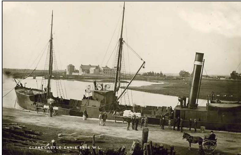
Clarecastle Port by W. Lawrence c.1900 – Clare Library