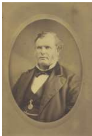
William Carroll 1817 – 1889