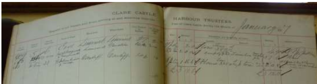
Clarecastle Port Shipping records

In the lead-up to the Gathering 2013 Festivities, a concerted effort was made to unearth old photographs, documents and artefacts pertaining to the history of the Parish. Some remarkable finds were made. These included a Register of Shipping covering the years 1914 to the end of the commercial life of the Port in the mid-1960s. The Minute Books of the Harbour Trustees for the same period also became