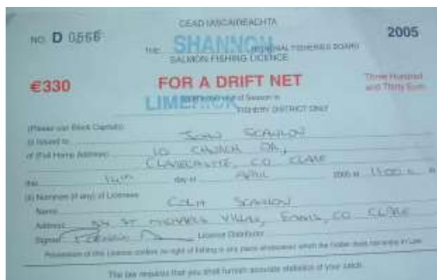
An example of a drift-net licence from 2005 Clarecastle -photograph courtesy of Eric Shaw Eric Shaw

The recently published Parish Map 1 gives fine details of the old fishermen's names of locations along the river that marked their drift-net movements. Gandalows are still being made by the Scanlan and Considine families.