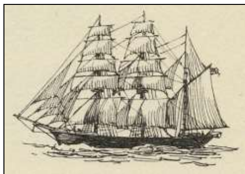
A three-masted barque