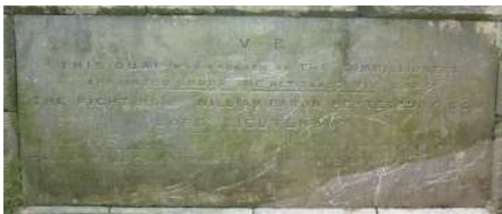
Plaque of wall of quay, Clarecastle