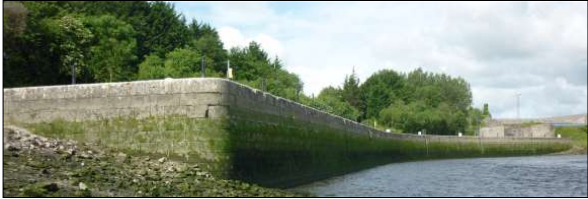
The Clarecastle Quay-wall

The quay is about 512 feet in length and is 16 feet 3 inches in height. There are nine stone steps at the northern end and thirteen stone steps at the southern end. Four iron access ladders with twelve rungs are inserted in the face of the quay-wall. [The Clare Journal states that there were five iron ladders]. Seven finely-carved stone mooring-posts are spaced along the quay for the attaching of mooring lines. The limestone for the quay may have been quarried in Ballybeg. Large discarded blocks of stone similar to the ones used in the construction of the quay, can be found in the area of Carroll's Quarry in Ballybeg today. The Limerick Chronicle of 9 April 1845 states that 5,416 cubic yards of rock and 7,922 cubic yards of clay and gravel were used in the construction of the new quay. The base of the quay is formed from a row of large cut stones that protrude slightly. The wall of the quay is constructed from rectangular ashlar limestone (dressed) blocks in regular courses which rise to ten courses in all. Some of these blocks of stone are quite large and it must have taken great effort and skill to cut and move these from the quarry to the edge of the river.