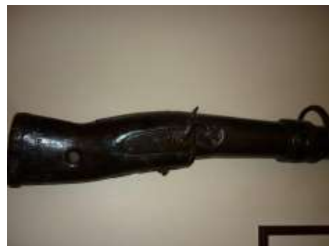
stock of punt-gun in Navan's Bar,