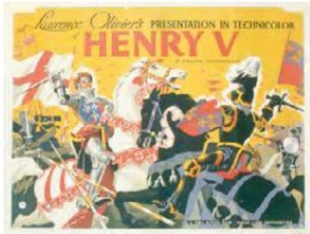
1943 poster for the film Henry V